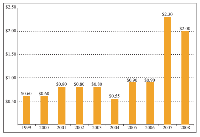
Distributions totaling $2.00 and $2.30 per share were declared or paid during the fiscal years ended November 30, 2008 and November 30, 2007, respectively. (See note 1.E. Dividends to Shareholders (page 12) and Certain tax information for U.S. shareholders (pages 15 and 16) for further comments.)

Historically, the South African gold mining companies paid relatively high dividends and contributed the majority of ASA's income. However, these companies no longer pay out the large dividends witnessed in the past and South African gold mining shares now represent a smaller portion of ASA's assets. Likewise, the platinum mining companies from which ASA has received the majority of its dividend income during the last two years are under severe pressure as a result of the decline in the platinum price and rising operating costs. Therefore, it is likely that dividends received by ASA may be substantially lower in the coming year than during the last several years. Capital gains realized by ASA have been higher during the last two years as a result of the diversification away from South African gold mining shares and the 2008 tender offer (see Notes to Financial Statements-Note 6) ("Tender Offer").